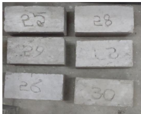
Fig.3. Sample of fly ash bricks with LDPE & LLDPE

The data was collected from various sources and the literatures were studied for knowing the mix proportions of all materials used in the fly ash bricks. The bricks of size 200mm x 100mm x 80mm are casted as per IS. 30 numbers of brick was casted by using the raw materials fly ash, lime, gypsum, fine aggregate, and by partial replacement of fine aggregate with plastic powder i.e., LDPE and LLDPE. The partial replacement of fly ash is done with 0%, 2%, 4%, 6% and 8%. Once the casting is over the curing is done for a period of 24 hours by oven curing and the temperature range is maintained at 110 °C. The compressive strength of bricks is obtained after curing. The compressive strength of 28 days is achieved by the sample, by the oven curing of 24 hours. Efflorescence test and water absorption test are also carried out. And finally the results are compared.