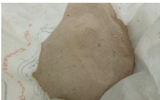
Fig 1. Low Density Poly Ethylene(LDPE)

LDPE is known as Low Density Poly Ethylene. It is a thermo plastic which is made from the monomer called poly ethylene. It is prepared from the first grade poly ethylene wastes. The poly ethylene waste materials are collected and recycled to a powder form by using various processes. The powder is used by industries for various purposes. By using this in bricks the fine aggregate can be replaced by some amount of this and the plastic waste generation can also be reduced. The cost is low when compared to fine aggregate.