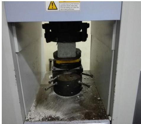
Fig.5. Compressive strength test of fly ash brick with LDPE

This test is carried out in accordance with IS 3495 (Part 1): 1992. After curing the bricks are tested in a compressive testing machine of capacity 2000KN to determine its compressive strength. The load is applied at the uniform rate. The maximum load at which the failure occurs is noted and from which compressive strength is calculated. Three bricks were tested for each proportion and the average value is taken.