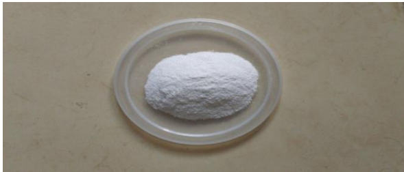
Fig.2.Linear Low Density Poly Ethylene(LLDPE)